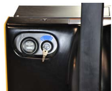
OUR METER BDI AND KEY STANDARD

Model - WPT45S only available with 27 x 48 fork dimension